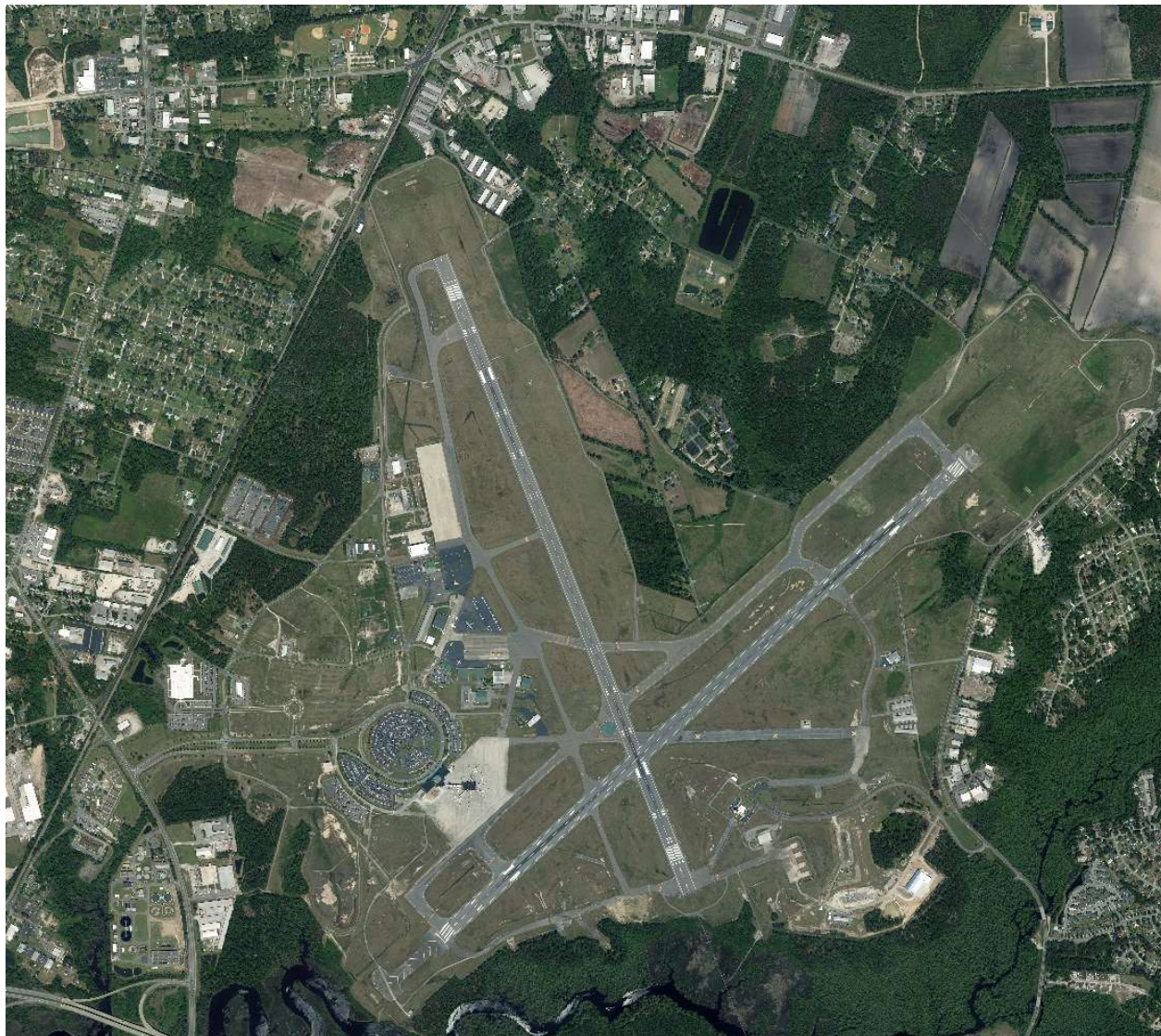
2019 Aerial Photograph